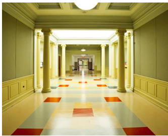
P.S. duPont Elementary School, Wilmington, DE