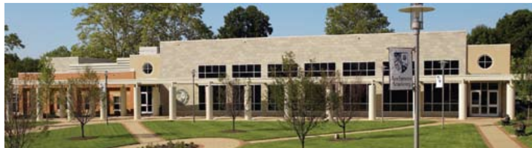
VIEW FROM THE GREEN

expansion of much-needed classroom space in other campus buildings. ■